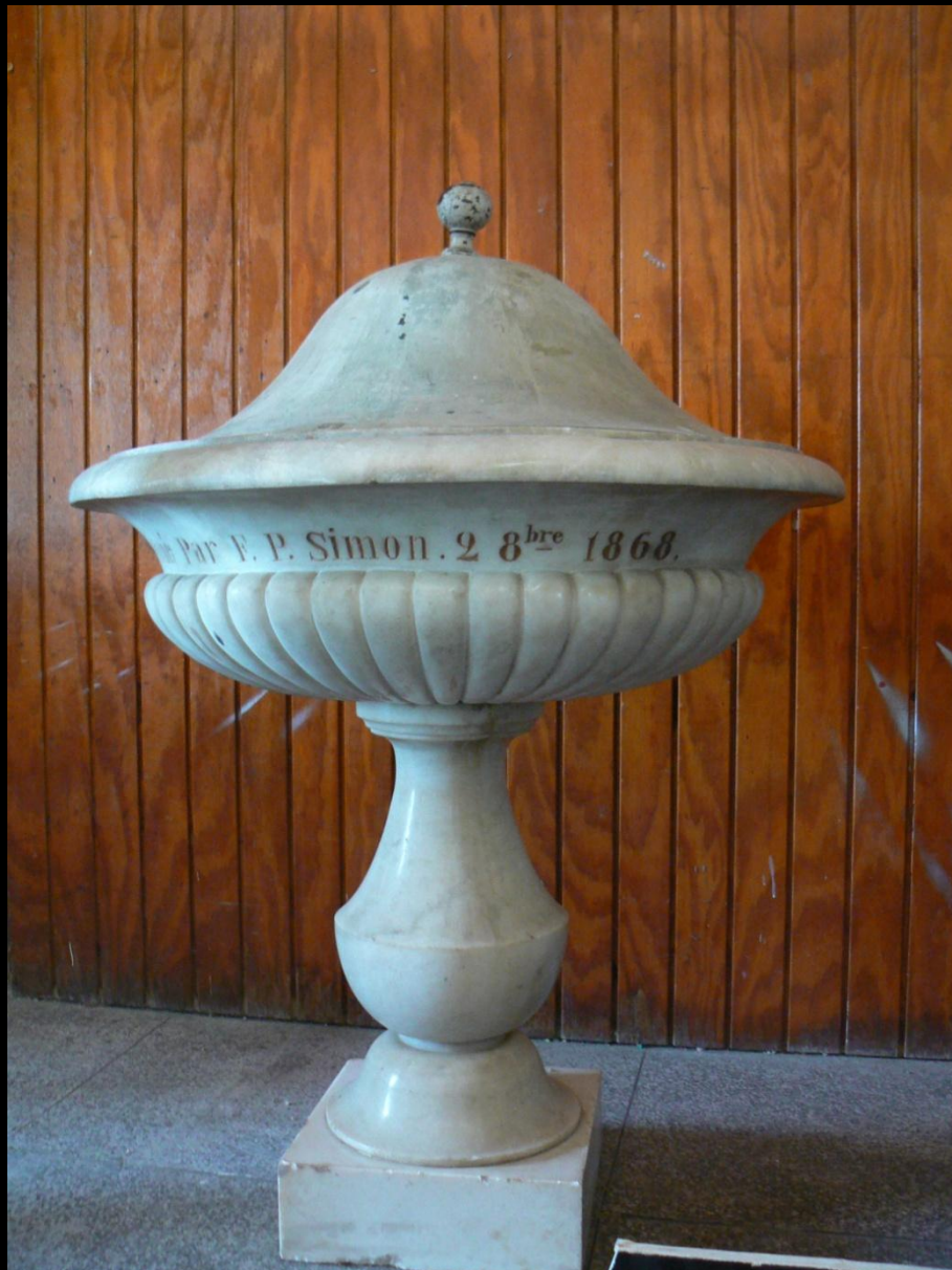
The BAPTISMAL FONT donated by F.P. SIMON dated 2th October 1868