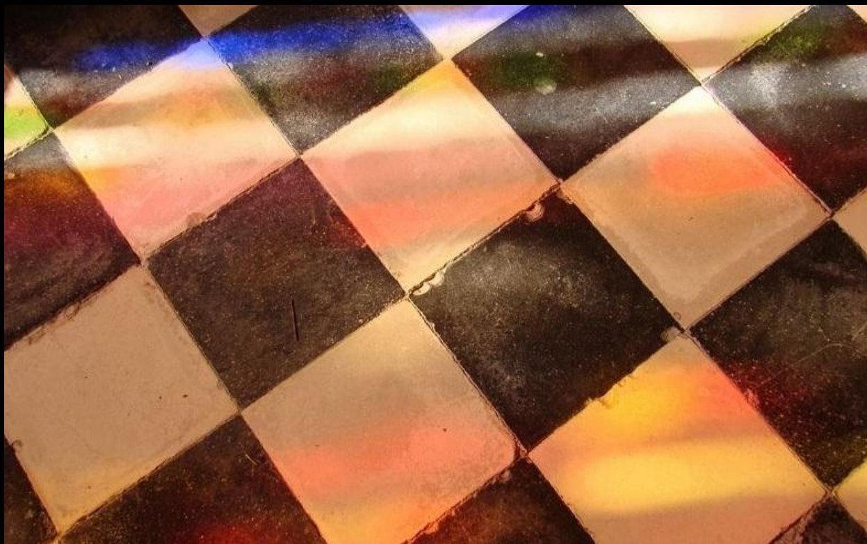
The marble tiles in the cathedral are visually transformed by coloured light

The black and white marble floor tiles, symbol of the valley of tears on this earth, are illuminated, brightened, transformed, and transcended by the coloured diffused light of the stained glass.